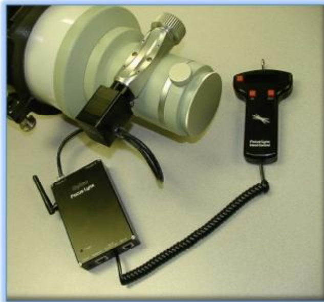
FocusLynx Controller Hub configured for MicroTouch motor. (Shown with FeatherTouch MPA/TRF pinion assembly on Takahashi TOA-130)

A simple MicroTouch motor control cable can be made from any Ethernet Cat5 cable. Optec offers complete packages which include the FocusLynx hub and this motor cable, or a full temperature probe kit to allow temperature compensation with the FocusLynx controller and MicroTouch motor.