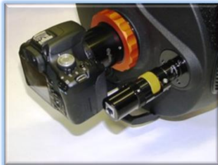
FocusLynx QuickSync motor with Feather Touch FTM Micro Pinion Retro-fit on a Celestron C11 HD.

NOTE: For some very long travel focusers like the FTF3545 and all the FTM Micro Pinion Retro-Fits, you may need to manually re-focus and Sync again to utilize the full focuser travel range. Each step corresponds to approximately 1 micron for the FTF focusers (much less with the FTM) so the 16-bit resolution of FocusLynx will allow up to about 65mm of travel. Fortunately, you will find that you will only need a few hundred steps to maintain focus once it has been achieved.