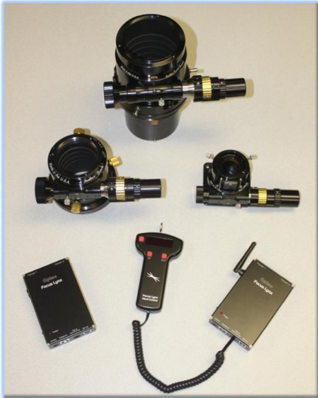
FocusLynx FT QuickSync with FeatherTouch Focusers